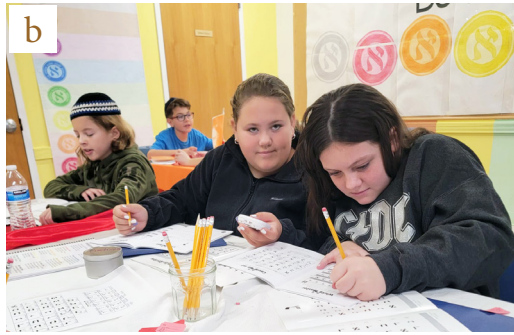
b. The next generation learning Hebrew fluency