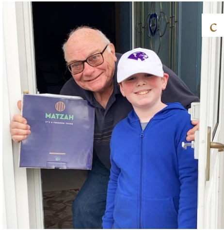
c. Spreading the happiness of Passover