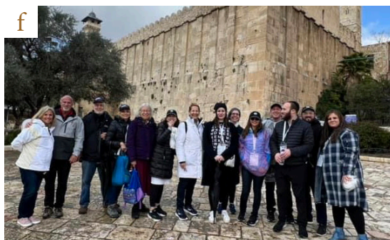
f. Visiting the tombs of our grandparents in Hebron