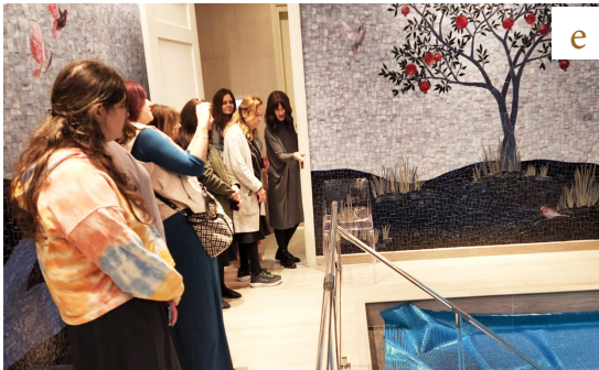
e. Learning the secrets of Jewish intimacy at a Mikvah tour