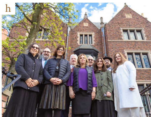
h. Brooklyn tour with Shabbat in the Heights