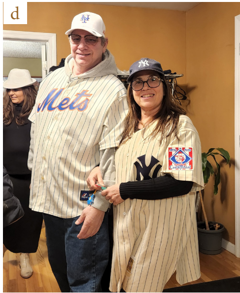
d. Having a great time at the Purim adult social