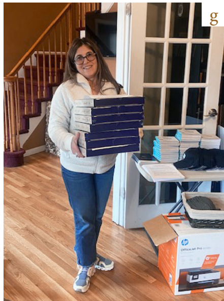
g. Getting ready to deliver 1,000 boxes of Matzah to the community