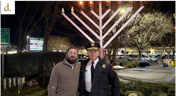
d. Bringing physical and spiritual blessing to the community