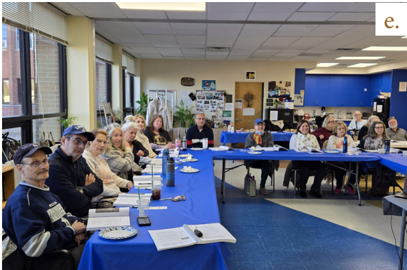
e. A full house learning Jewish advice on deepening our relationships