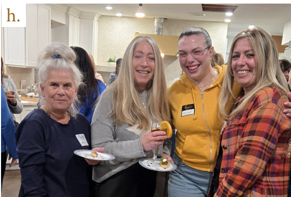
h. An evening of light, laughter, and l'chaim at the Menorahs & Martinis