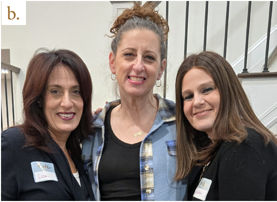
b. The ladies having a blast at the Chanukah social.