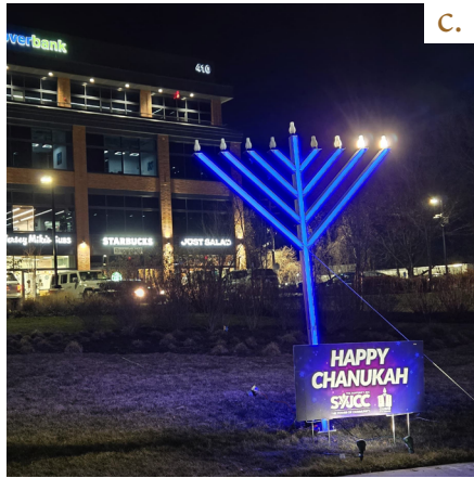
c. A new menorah welcoming people to the Hauppauge Industrial Park