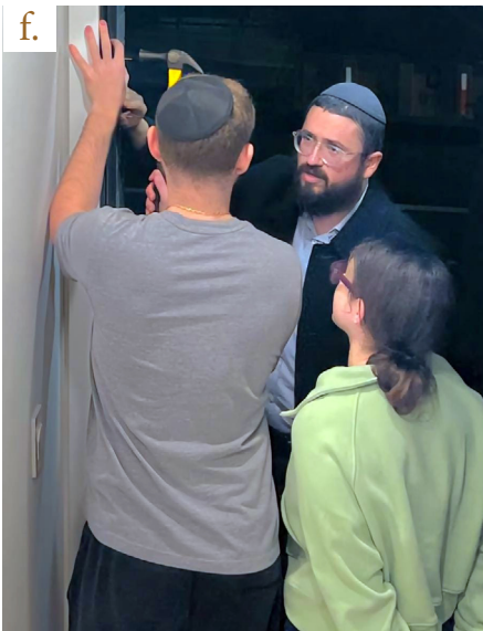
f. Another home is blessed