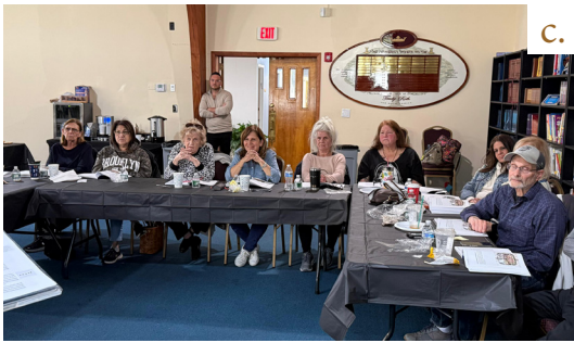
c. Starting off the week with some Torah