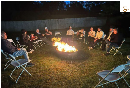
g. Lag BaOmer BBQ with our community!