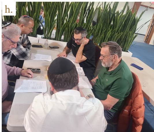
h. Yeshivah night, revealing the secrets of the Torah