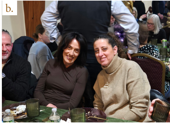
b. Purim was filled with wonderful laughter at our adults comedy night!