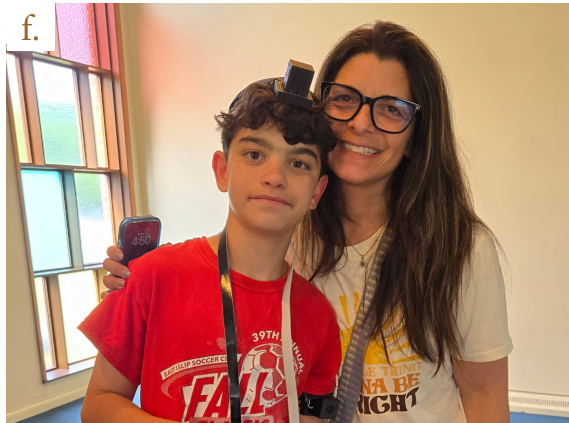
f. The next generation bound to our Father in heaven