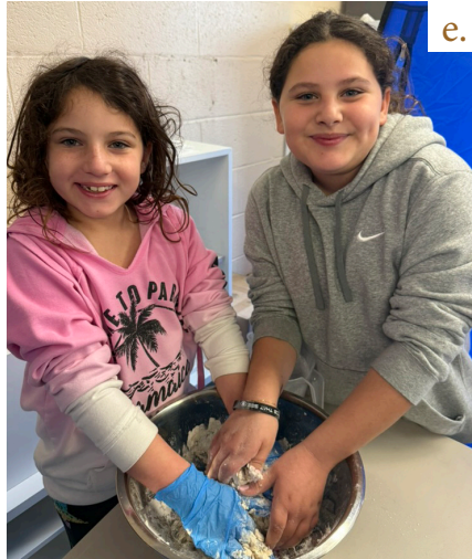
e. Hebrew School learning the Alef Bet and preparing for Passover by making matzah