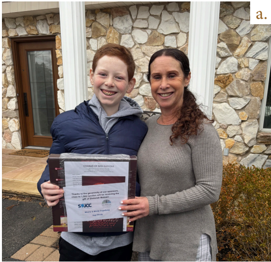
a. Close to 1,500 handmade Shmurah Matzahs were delivered around town for Passover.