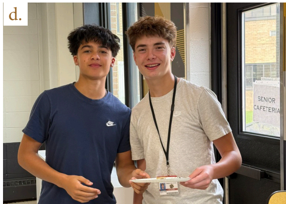
d. Our monthly HCC in Commack High School learning about Lag BaOmer