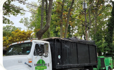
AND HAD TO CUT DOWN SOME TREES TO MAKE THE SUKKAH KOSHER