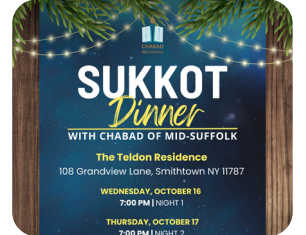
REMINDERS GO OUT