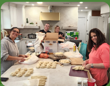
SO MANY CHEFS IN THE KITCHEN