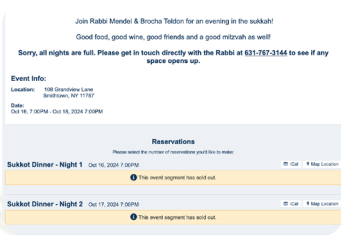
WE RAN OUT OF SPACE...