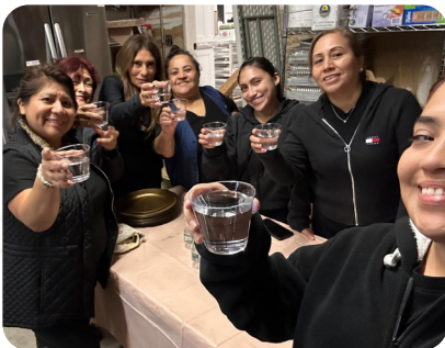
WAITRESSES READY TO SERVE