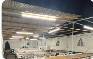
...SO WE GOT AN EXTENSION