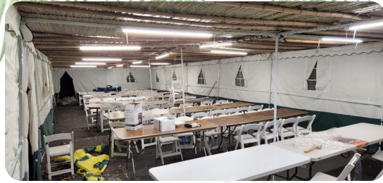
TABLES AND CHAIRS SET UP...