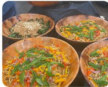
SALADS ARE READY TO BE DRESSED