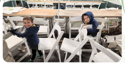
...BY THESE GUYS