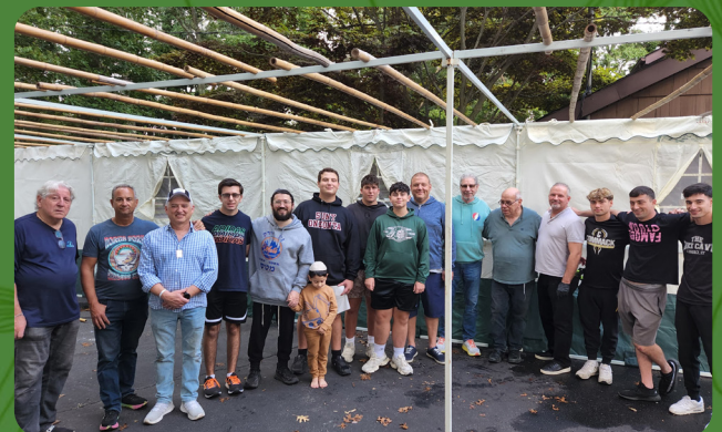
THE A-TEAM BUILDS THE SUKKAH