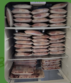
LOTS OF CHICKEN