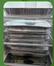
AND THE FAMOUS STUFFING