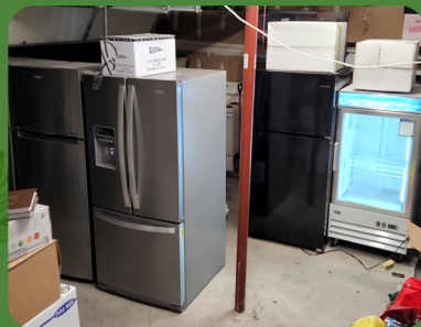
RENT 11 FRIGS & FREEZERS