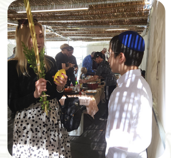
...AND SHAKE THE LULAV AND ETROG