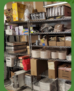
GET SOME PAPERGOODS