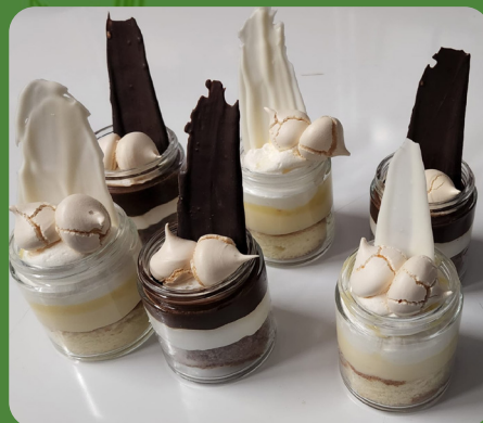
AND DONT FORGET DESSERT