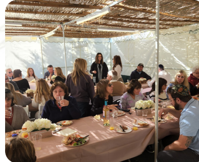
JUST FOR FUN, ON SUNDAY WE HAD 100 PEOPLE FOR BREAKFAST TO EAT IN THE SUKKAH...