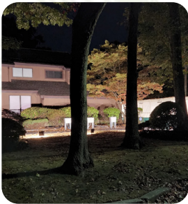
THE NIGHT BEFORE, EVERYTHING IS READY