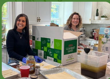
..AND MORE CHEFS