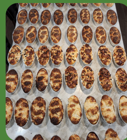
MAKING LOTS OF CHALLAH