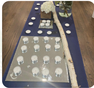
CANDLES READY TO BE LIT