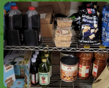
EXPAND THE PANTRY