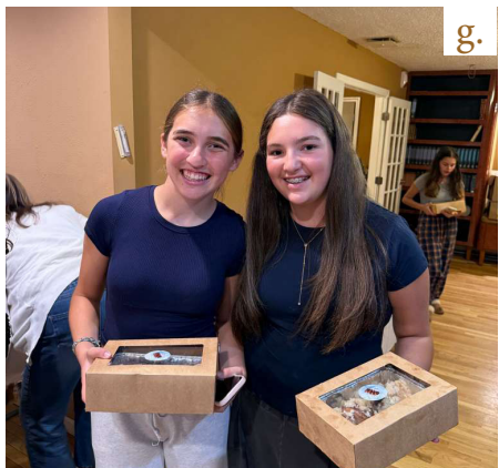
g. Babka bake for the girls