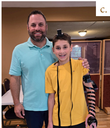
c. Next generation connection to Hashem