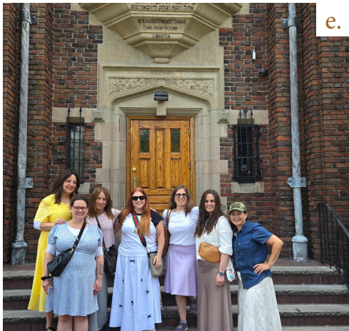
e. Women's Tour of Chassidic Brooklyn