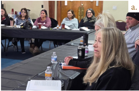
a. Our JLI class loves to keep learning