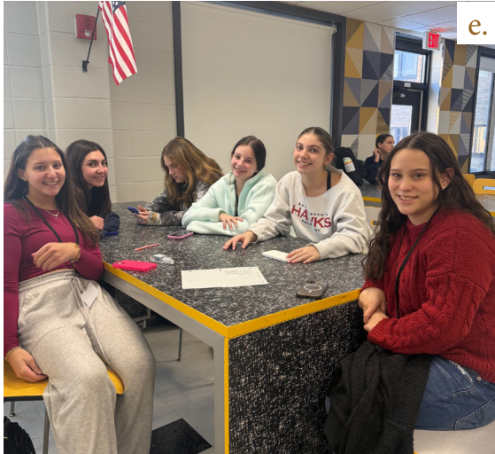
e. Commack High School making chocolate bars after learning about Tu Bshvat