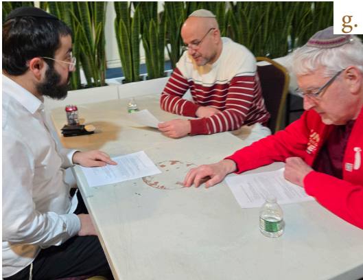
g. Great night learning at Yeshiva night