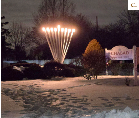
c. Bright new beginnings