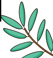
i. Another home is blessed!