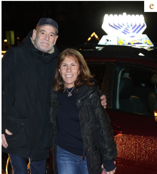
e. The Menorah parade celebrated Chanukah throughout the town