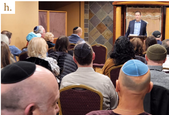
h. Fascinating lecture on the situation in Israel and some things we all can do to help.